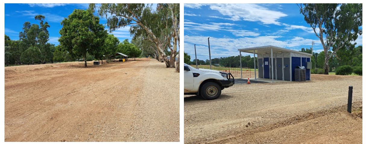
Figure 5: Parking area on Manildra Street is being revitalised

The parking area in front of the new toilets on Culling Street is progressing well. The area will provide parking for the new toilets and the barbecue area to the east. The car parks will be sealed, and line marked, with boulders to prevent access onto the grass. In the coming months irrigation and lawn will be installed to revitalise the area.