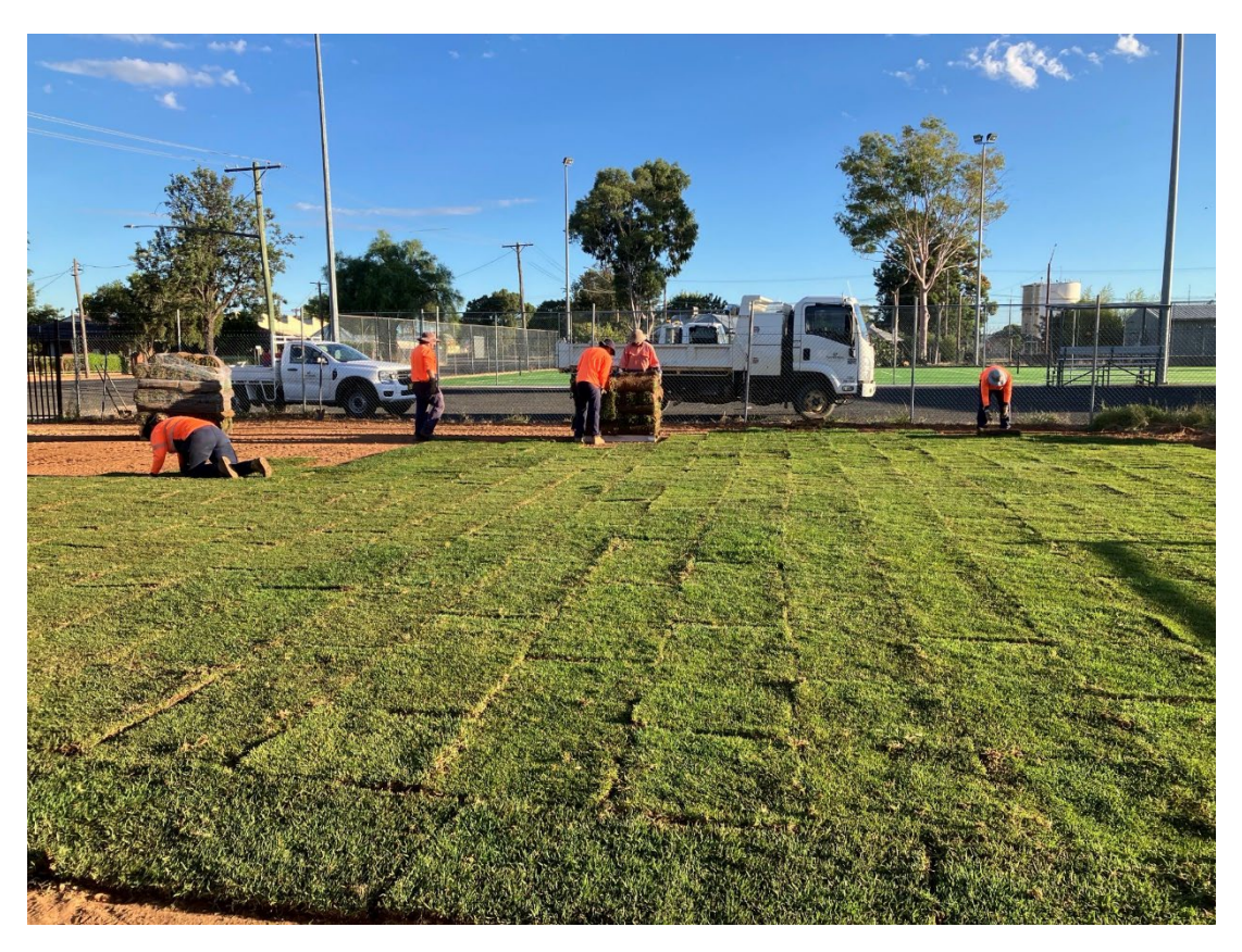
Figure 6: New Turf installed at Cale Over