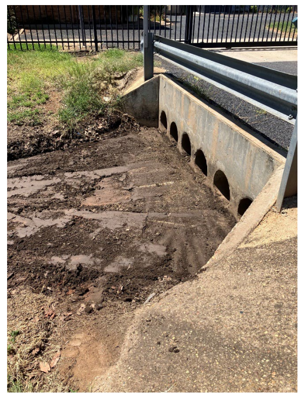
Figure 7: Stormwater drain cleaning occurred across Narromine in February