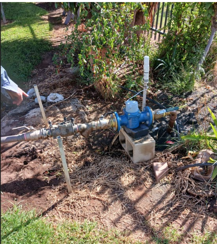
Figure 2: New Smart Meter installed at a property in Narromine

In addition to maintenance and capital work around town, the water team is responsible for maintaining analytical equipment for testing water quality. To ensure water quality the team frequently tests the water with laboratory equipment.