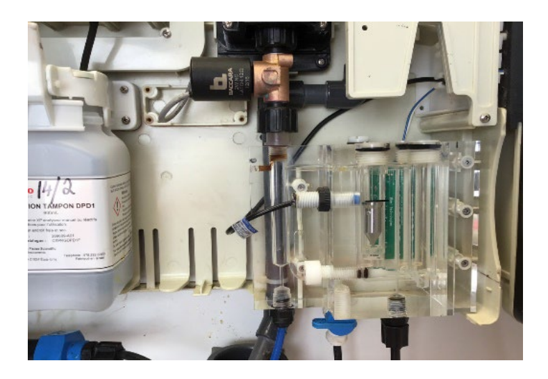
Figure 3: Laboratory equipment is calibrated frequently to ensure accurate water quality testing.

In addition to maintenance and capital work around town, the water team is responsible for maintaining analytical equipment for testing water quality. To ensure water quality the team frequently tests the water with laboratory equipment.