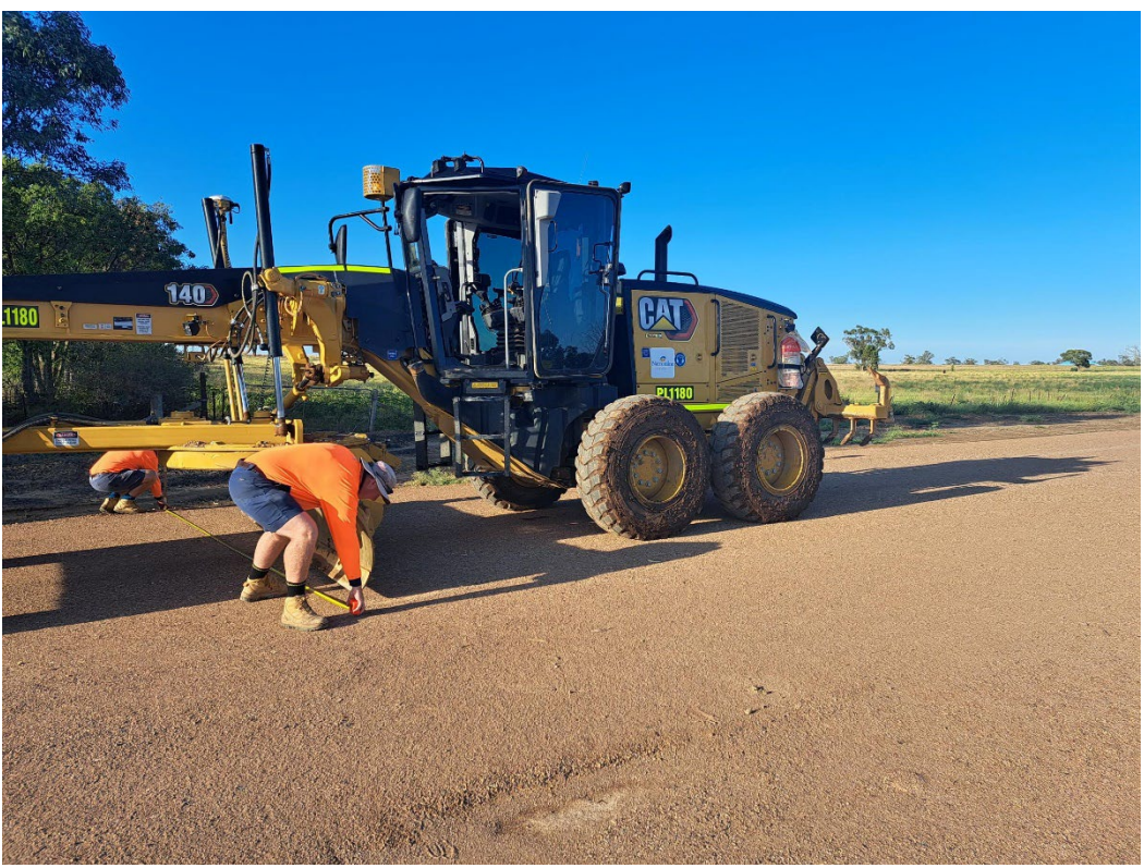
Figure 8: One of Council's grader teams inspecting the road width

Council is currently working on a few road projects. The intersection of Gainsborough Road and Tullamore Road progressed well throughout February and works on the intersection are expected to be completed by late March. The team will then start work on Tomingley Road end of Gainsborough Road. Access to the Narromine Waste Depot will mostly not be impacted, however, it is possible some minor changes will be needed during the works.