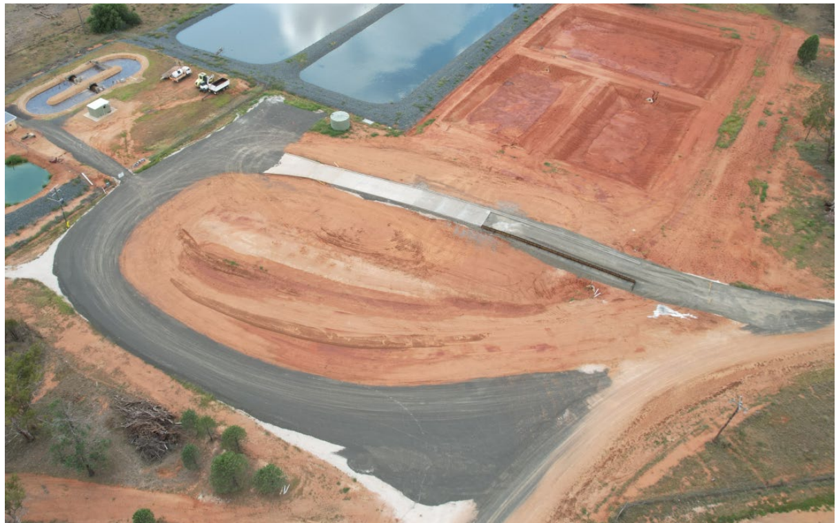
Figure 9: Aerial view of Trangie Truck Wash

The Trangie Truck Wash continues to progress. Contractors will start construction of the receiving chamber and water management system in mid-March. With the project expected to be completed and ready for official opening in May.