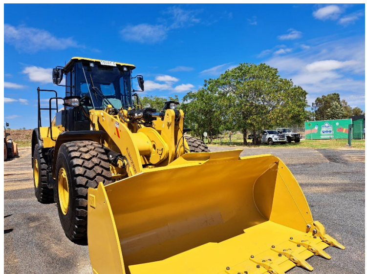
Figure 4: New CAT Loader at the Narromine Waste Depot

Council continues to work with our supplier to upgrade the waste depot software. This upgrade will significantly increase the data we capture on types of waste and improve the payment system for customers using the tip. Council also received a new loader at the Narromine Waste Depot. This loader replaces the broken loader and is fit for purpose. During the period the loader was broken Council hired a temporary loader.