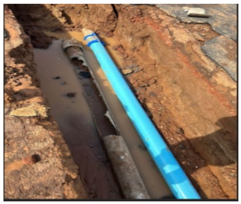
Figure 1: Replacement water main in Temoin Street

The Water and Sewer team have been busy this month completing works on the valves on the water mains in Temoin Street. This work will ensure continuity of supply for Timbrebongie House's fire safety and fire sprinkler booster system, ensuring fast and effective water coverage in the event of an emergency.